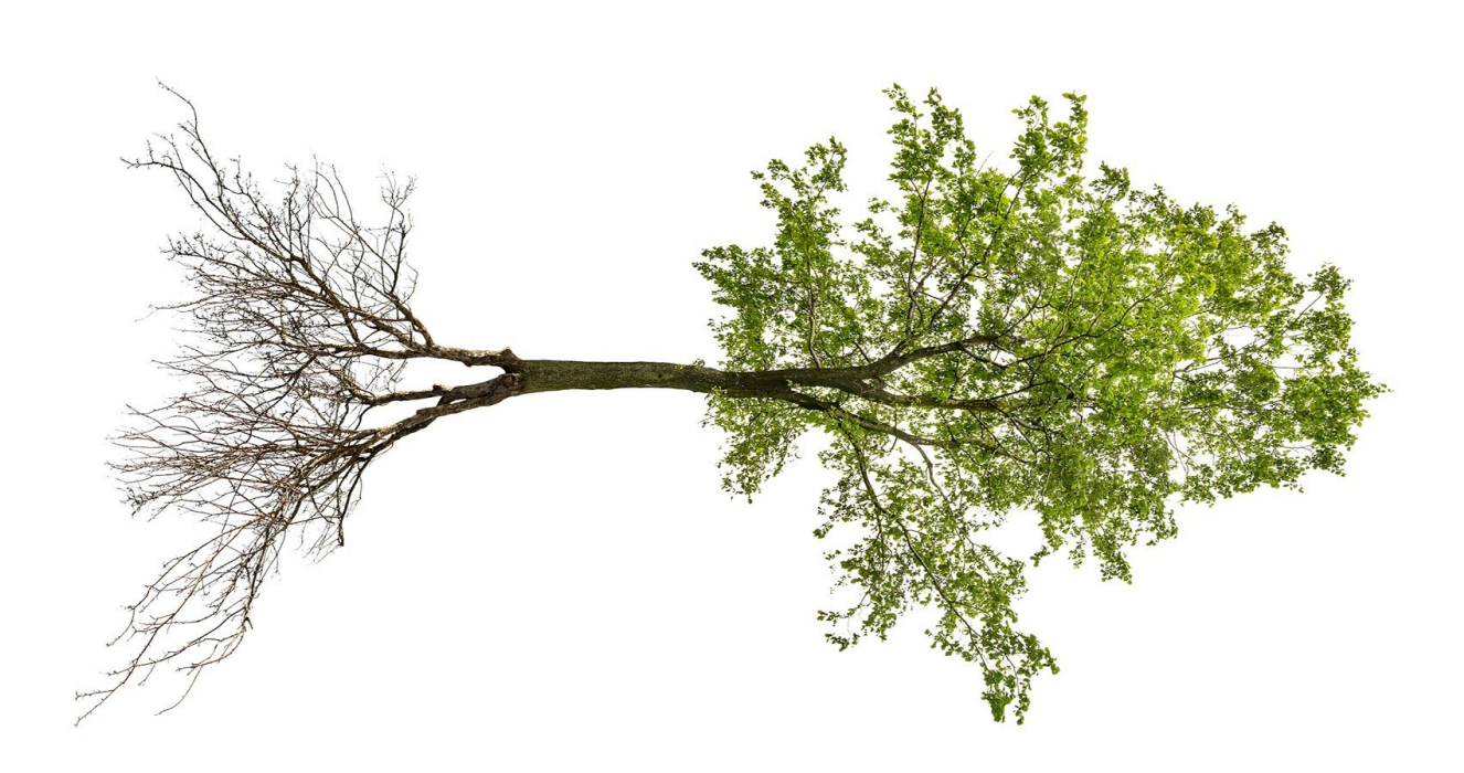
Monday 3 April, 4:15 pm, Digital Conference Room – Hall 32 Building and improving a digital heritage

Strategies for successfully creating digital assets for publishers and beyond: how to improve new and existing digital contents while building web and mobile applications to create new interactive experiences.