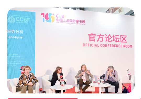
Conferences and Seminars